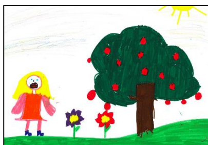
Figure 2. Cluster A PPAT with a potent and neutral tree in terms of accessibility, and a person with low agency.