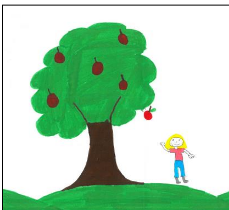
Figure 1. PPAT with partially active person who does not touch the tree. Tree inclining slightly away from the person, with six apples equally distributed.

Data analysis shows that the common drawing for this sample includes a tree with an equal amount of strength and weakness, with five to six apples equally distributed. The tree inclines slightly away from the person, although the branches are neutrally placed in regard to the person's position and are accessible from both sides of the tree. The person is shorter than the tree (about 1:3), partially active in the picking process, and is not touching the tree. An example for the common drawing can be seen in Figure 1.